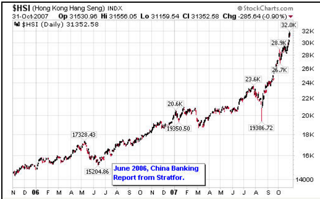
[Chart from Fear and Perception, released on Nov 1 '07]