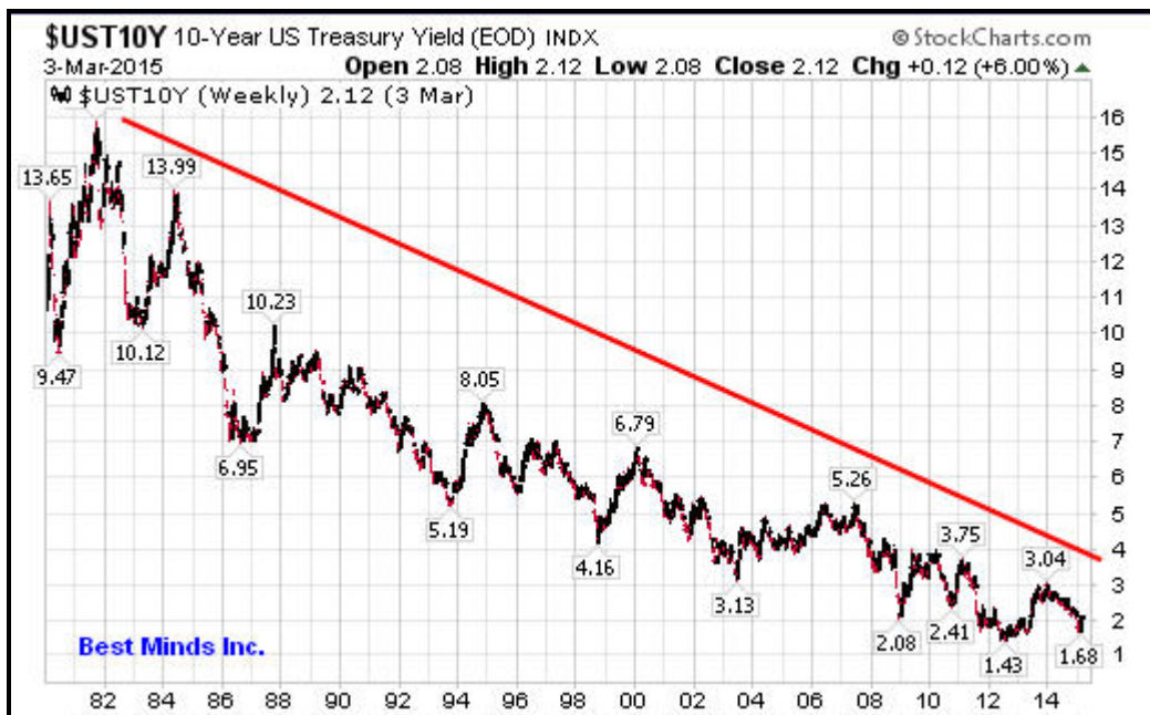
[Chart pulled from March 6, 2015 issue of The Investor's Mind: The Great Liquidity Ruse ]

Every investor expects that there will be plenty of liquidity, or in laymen's terms, plenty of buyers for their investment or plenty of cash to exit into when they get ready to cash out a portion of their investments and go spend the money. Yet, the problem Prince certainly must have known about in July 2007 was the collapse of two Bear Stearns hedge funds in June, wiping out $1.8 billion of investors' capital. Before the public would see headlines celebrating the Dow's close above 14,000 for the first time on July 19 th , trouble with liquidity had already started.